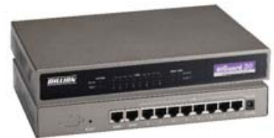
▲ BiGuard 30