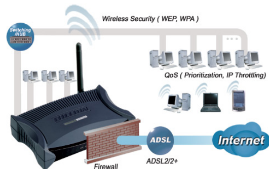
▲ Application Diagram (BiPAC 7202GR2)

Specifications are subject to changes without notice.