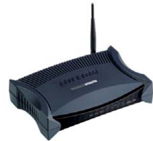
▲ BiPAC 7202GR2